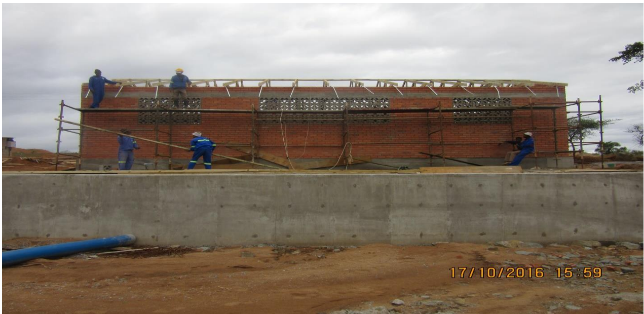
Pump house and sump construction at Mankisa