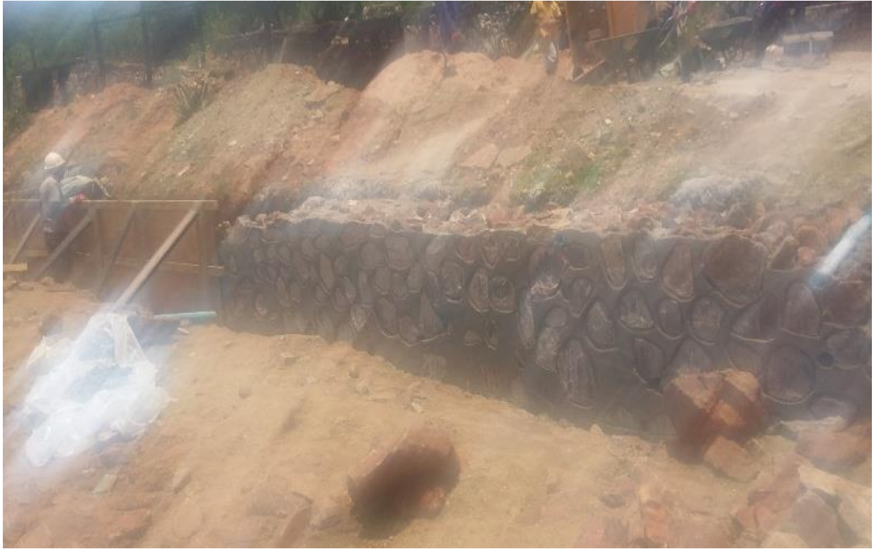
Masonry Stonewall construction (retaining wall) for the campsite along river side.