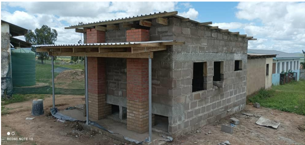
The Construction of School Kitchen at Mantambe Primary School