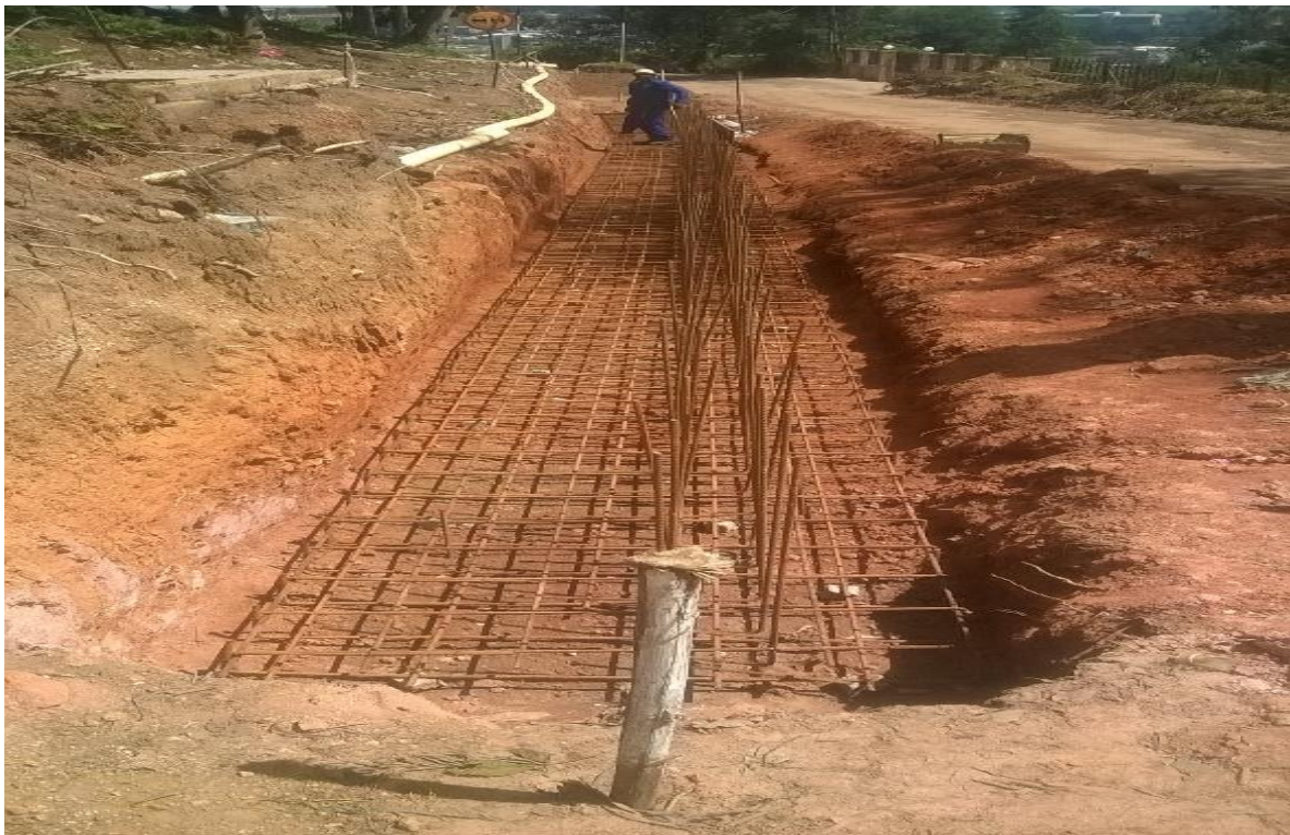
Retaining wall construction in road construction where we were subcontracting