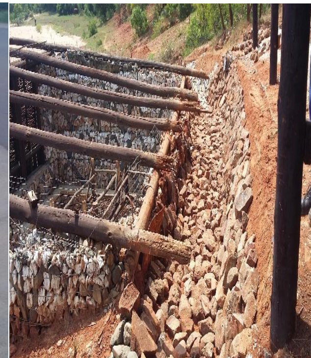
Stone pitch drain construction