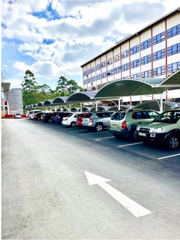
The construction of the car ports at the Ministry of Finance in Mbabane