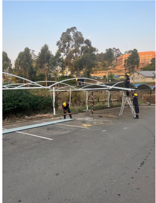
The construction of carports at Ministry of Commerce, Industry and Trade in Mbabane