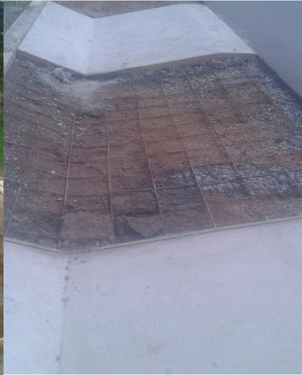
Concrete lined v-drain construction