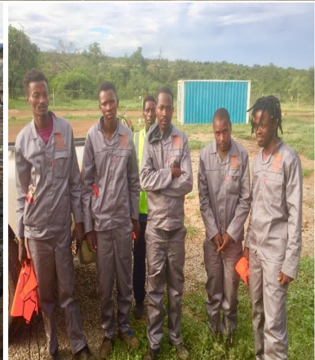
Ngubo Yengwe Construction stone pitching team during construction at Lusip II water project in Big Bend, Eswatini under INES JV, subcontracting under Inyatsi Construction.