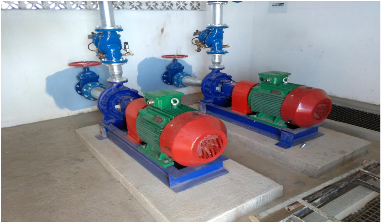
Portable water pumps installed for Mankisa Portable Water Project