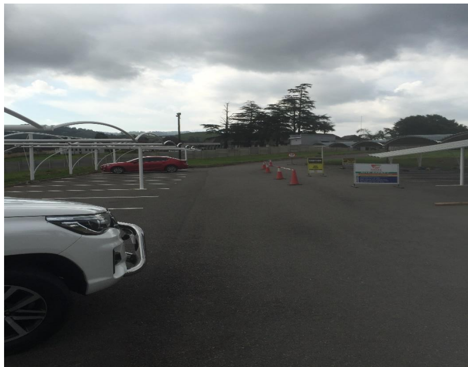
The construction of the car ports at the Prime Minister and Cabinet Offices in hospital hill, Mbabane