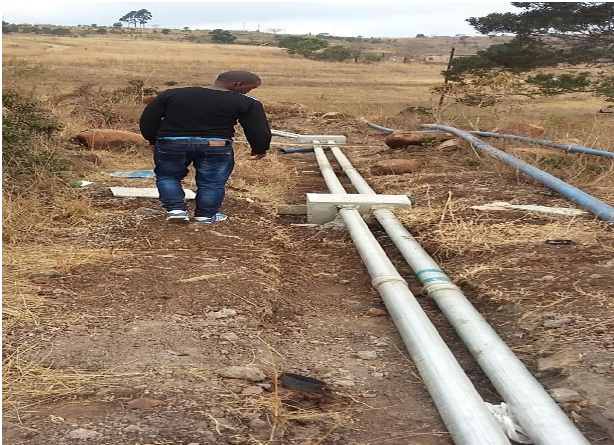
Rising main and distribution pipe for Sgcaweni portable supply water project