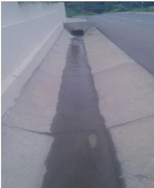
Finished concrete lined V-drain