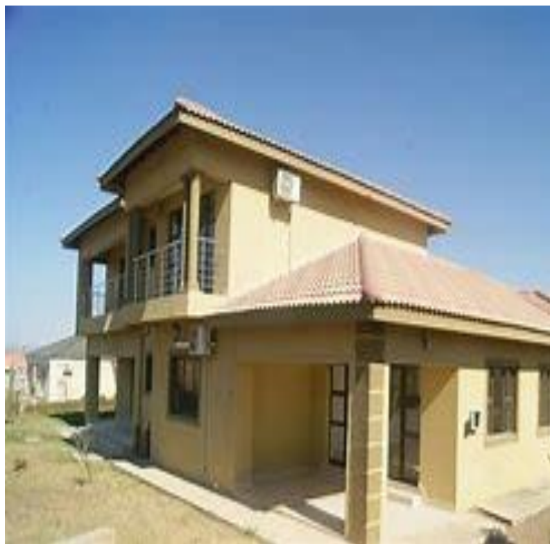
Various Building project undertaken by Ngubo Yengwe Construction for private Clients