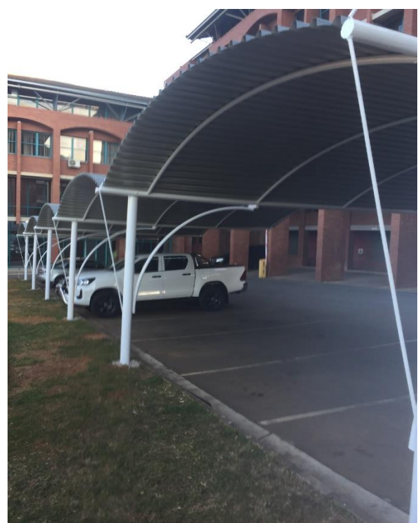
The Construction of the car ports at the Ministry of Information Technology and Communication (ICT) in Mbabane.