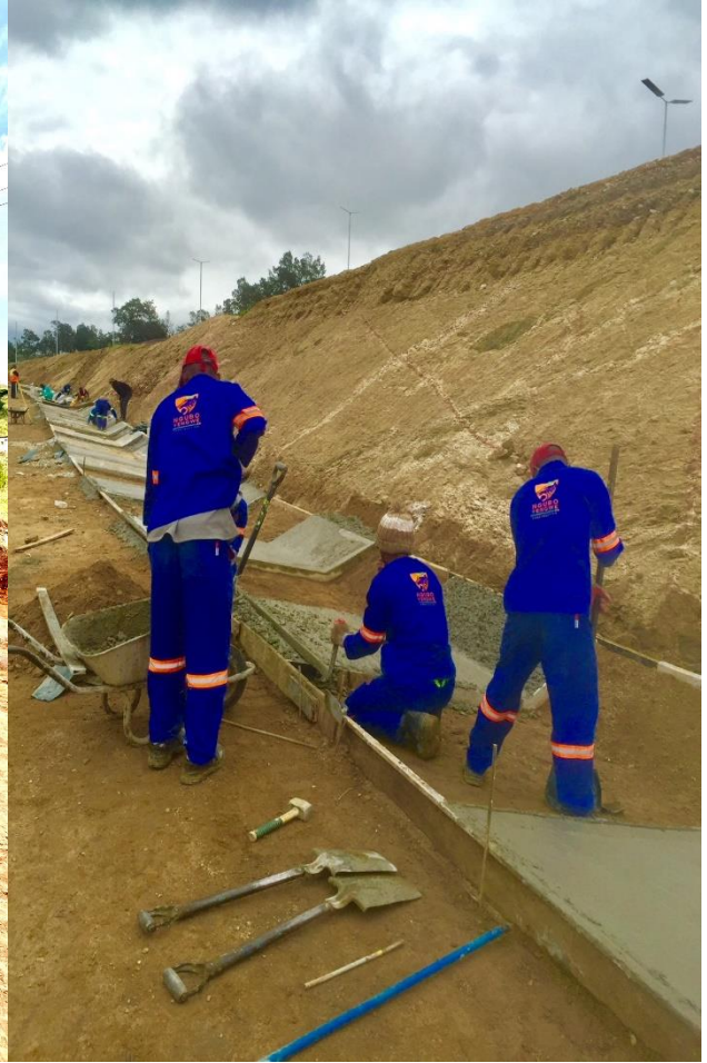
The Construction of V-drains by Ngubo Yengwe Team at MR3 Lot1 under Inyatsi Construction