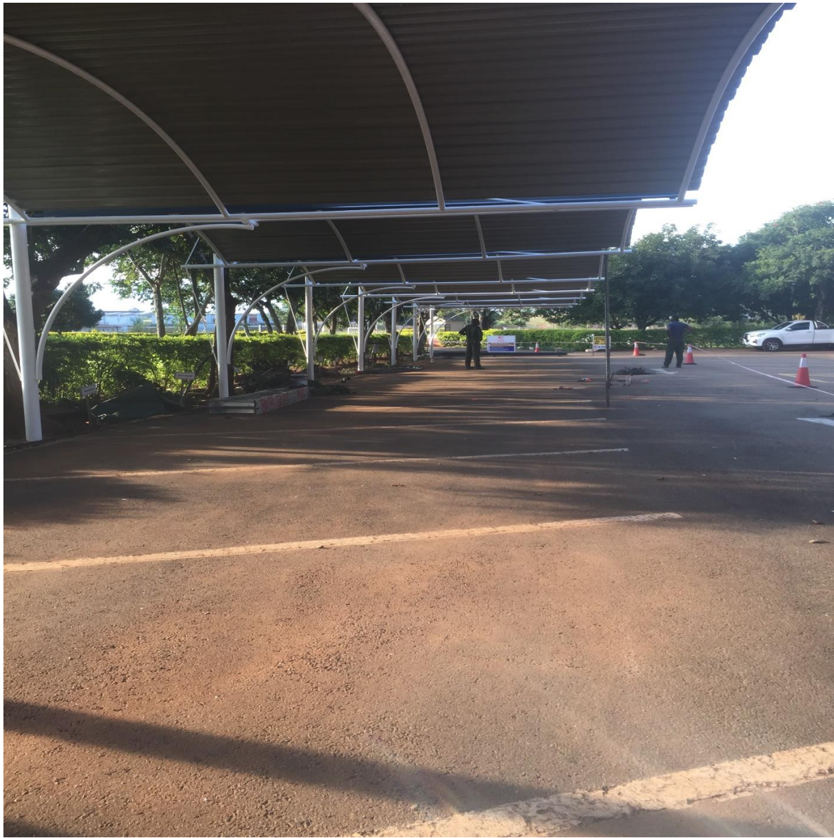
The Construction of the car ports at Eswatini Parliament in Lobamba.