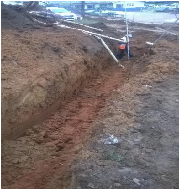
Setting out invert levels just before before pipe bedding is done.

Open drain excavation for storm pipe laying. Trench excavation and pipe laying