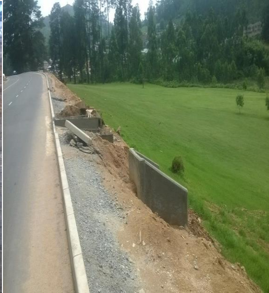
Headwall construction, reinforced mass concrete where we subcontracted