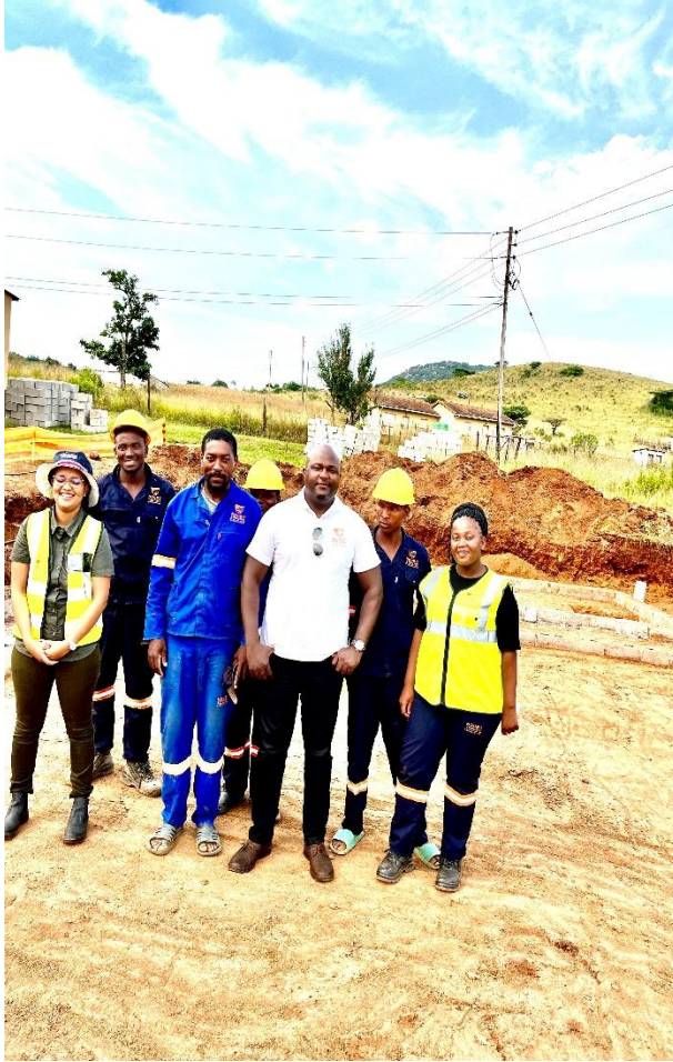
Ngubo Yengwe Team at Othandweni Primary School during the construction of Home Economics Laboratory