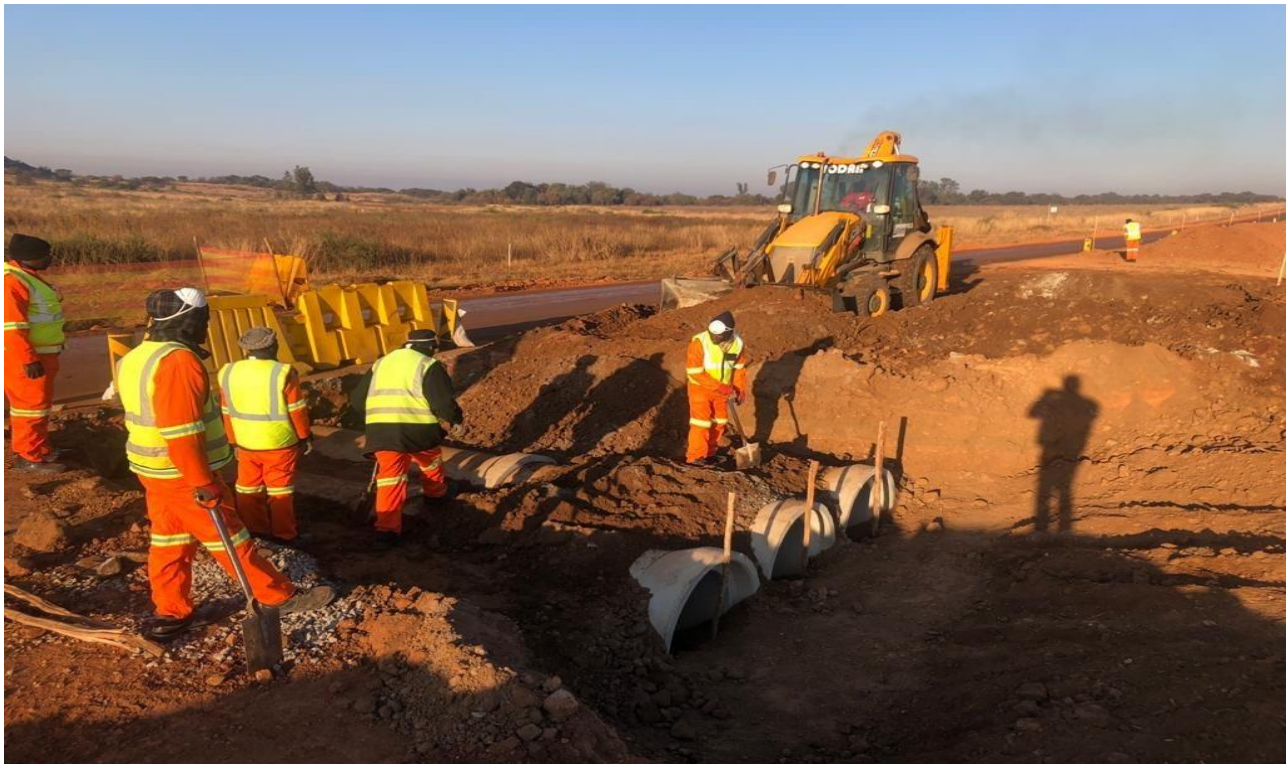
Backfilling of culverts at Eposini area, Shiselweni Region