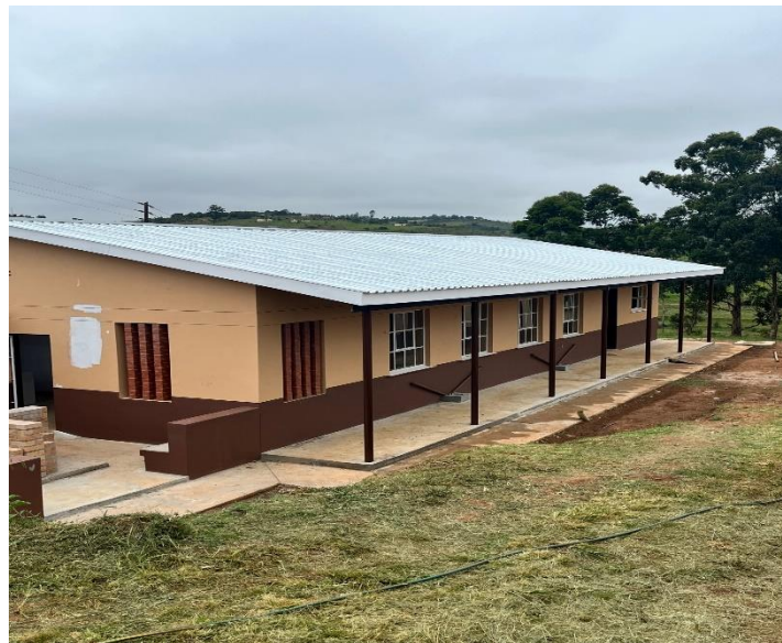
Building of Consumer Science Laboratory at Othandweni Primary School