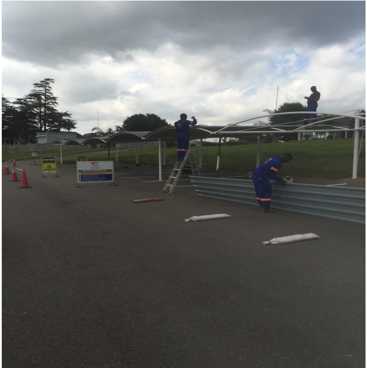
Ngubo Yengwe team pitching up special chromadek IBR sheets at the Prime Ministers and Cabinet Offices in Mbabane.